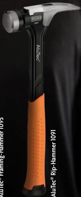
AluTec® Rip-Hammer 1091