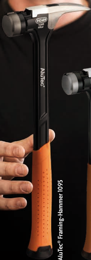
AluTec® Framing-Hammer 1095